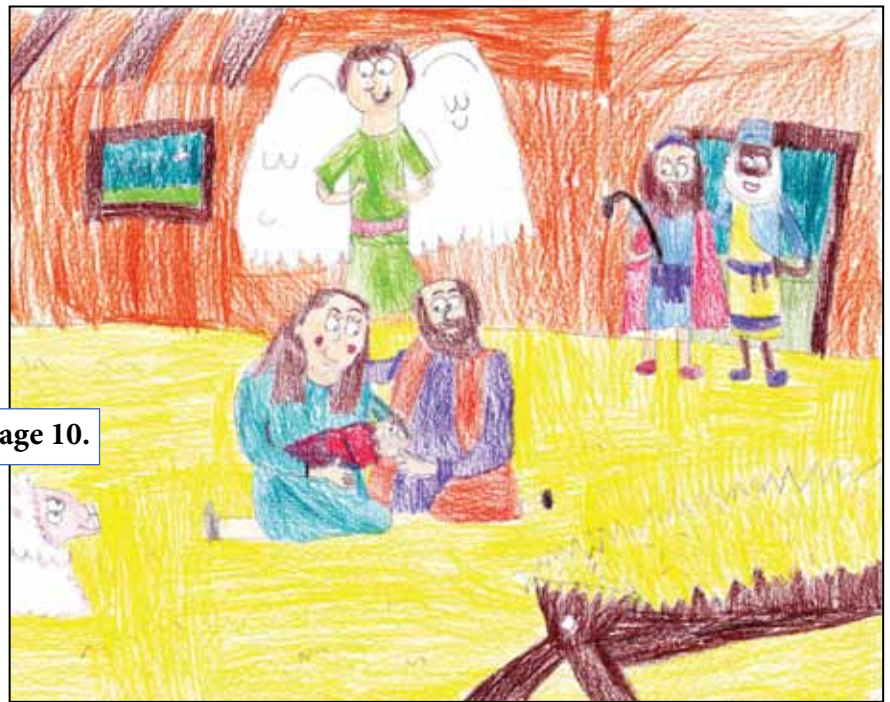
Right: Drawing by Carly Mayzum, age 10.